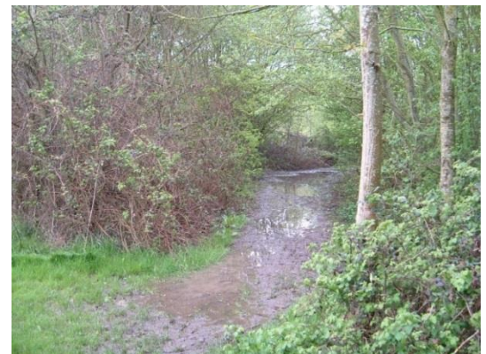
Below: the current path in wet weather